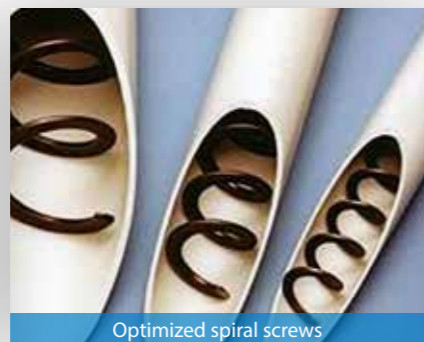
Optimized spiral screws