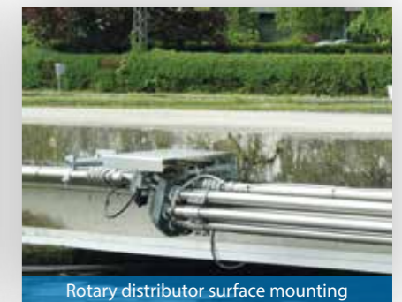
Rotary distributor surface mounting