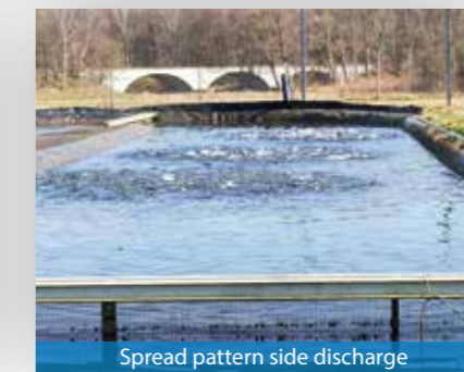
Spread pattern side discharge