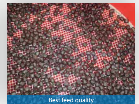
Best feed quality