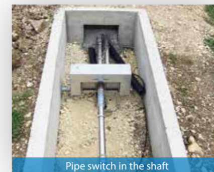
Pipe switch in the shaft