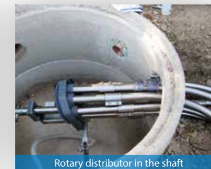
Rotary distributor in the shaft