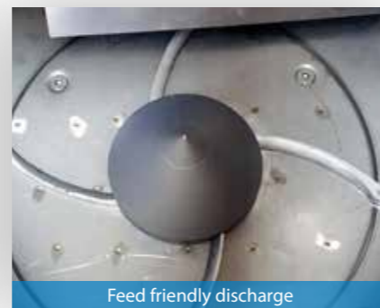
Feed friendly discharge