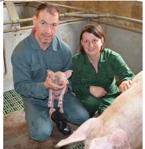
„We think, our sows enjoy it too!“